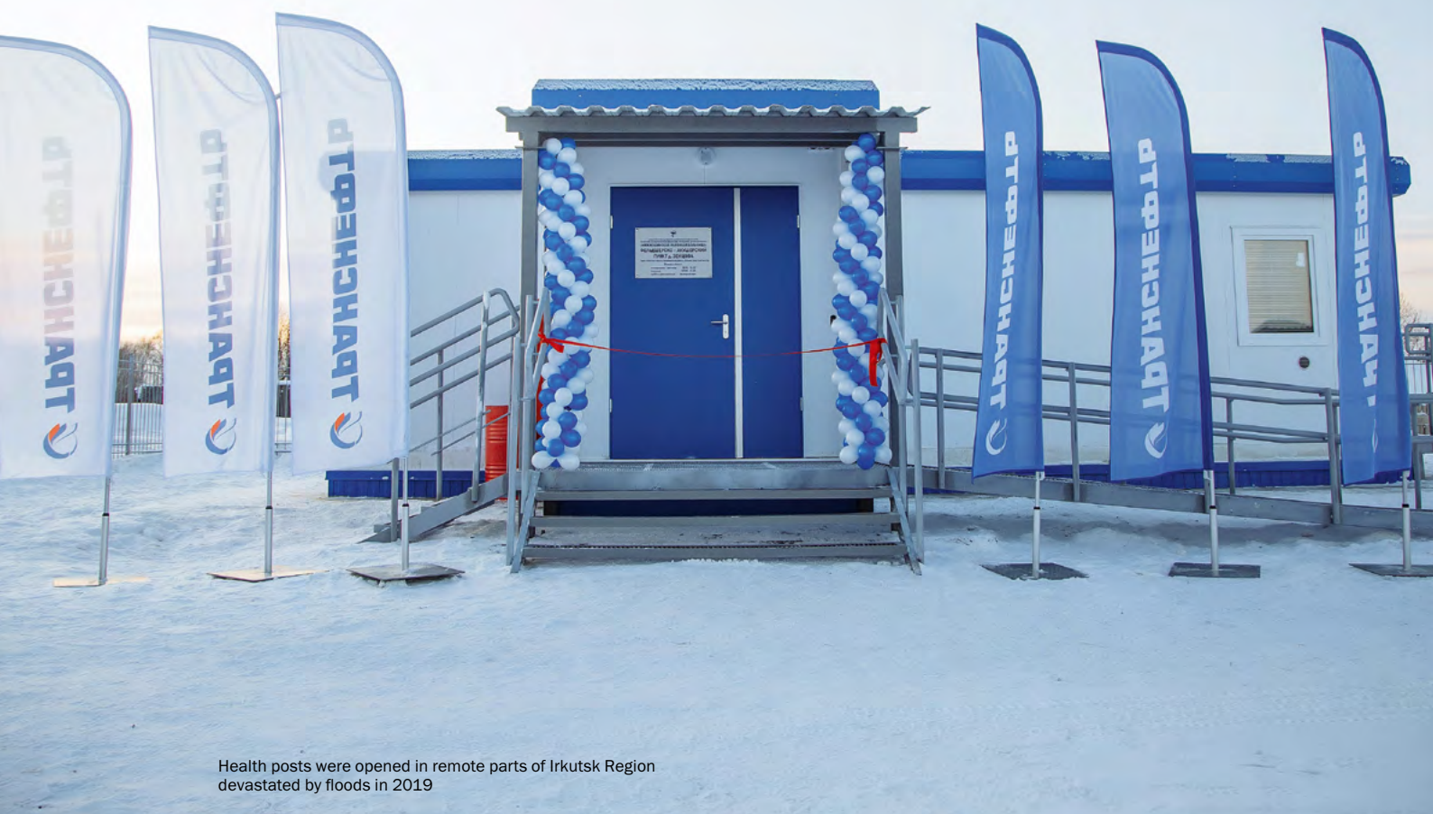
Health posts were opened in remote parts of Irkutsk Region devastated by floods in 2019